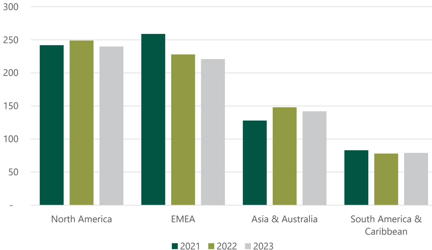
Meetings Voted by Region

During the 2023 proxy season, we voted at meetings across 45 different countries.