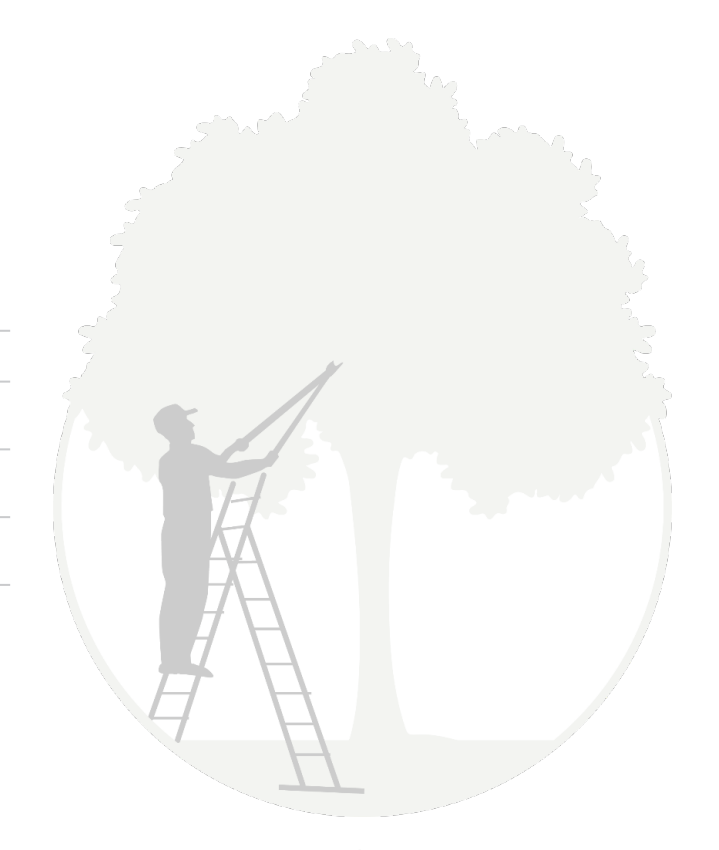
Business Value Creation