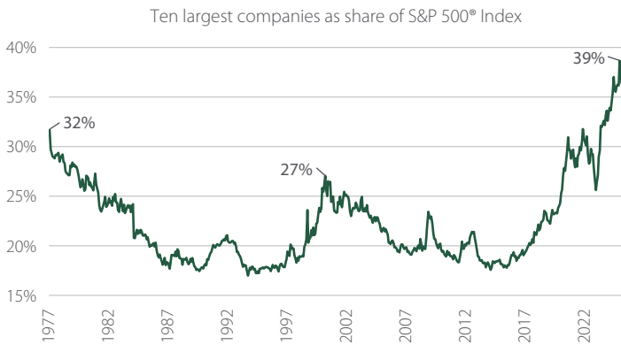
Exhibit 1: Market Concentration at All-Time Highs

As of 28 Feb 2025.