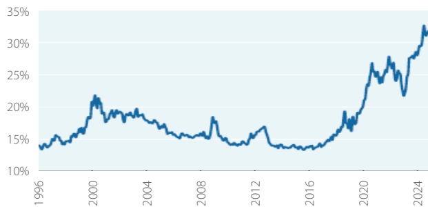
Exhibit 1: Market Capitalization of Largest 7 Companies in S&P 500® Index

As of 30 Nov 2024.